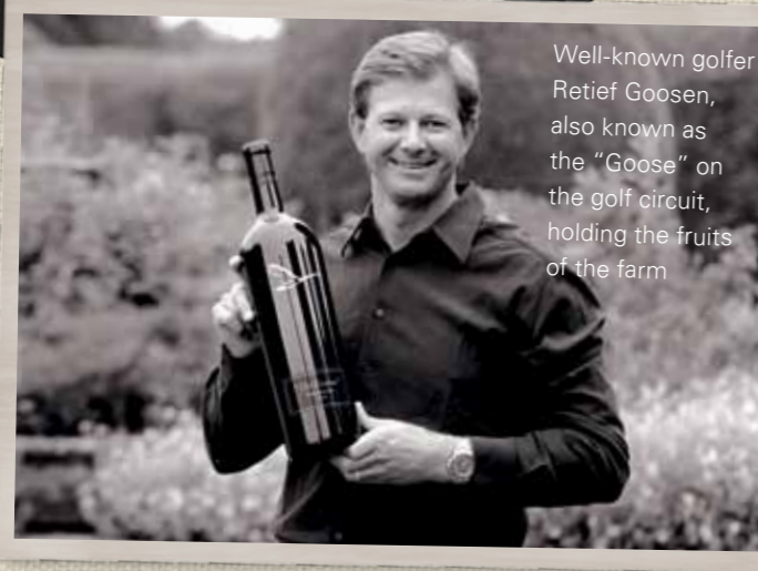
Well-known golfer Retief Goosen, also known as the “Goose” on the golf circuit, holding the fruits of the farm